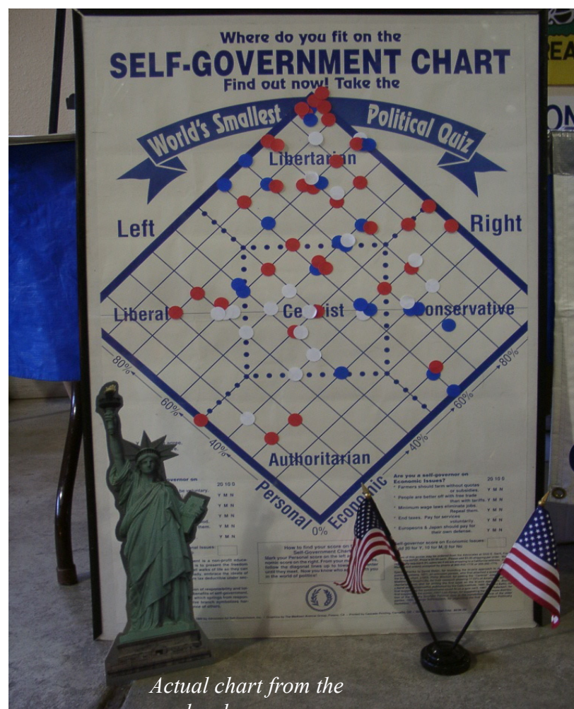
Actual chart from the weekend